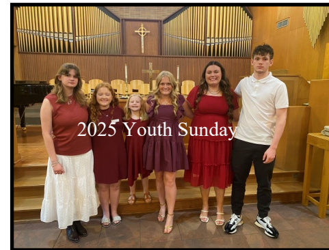
2025 Youth Sunday